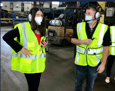
Rep. Haley Stevens (MI-11)