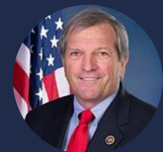
Health, Employment, Labor & Pensions Chairman Mark DeSaulnier