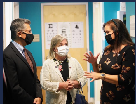
Rep. Susan Wild (PA-07)