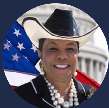
Higher Education & Workforce Investment Chairwoman Frederica Wilson