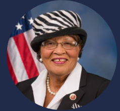
Workforce Protections Chairwoman Alma Adams