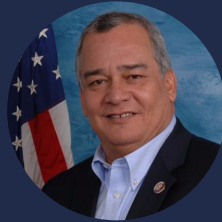
Early Childhood, Elementary & Secondary Education Chairman Gregorio Kilili Camacho Sablan