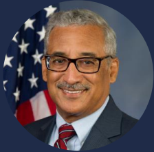
Full Committee Chairman Robert C. "Bobby" Scott