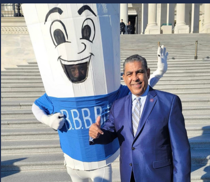
Rep. Adriano Espaillat (NY-13)

Allows nearly 9 million more children to receive free school meals by expanding eligibility, eliminating paperwork, and helping more children get healthy meals over the summer.