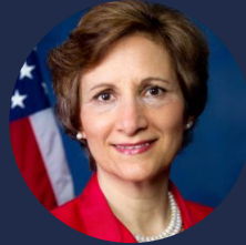
Civil Rights & Human Services Chair Suzanne Bonamici