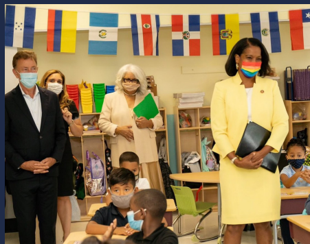
Rep. Jahana Hayes (CT-05)