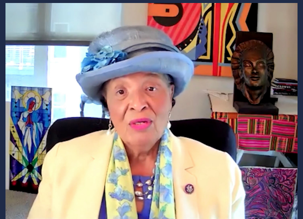
Subcommittee Chair Alma Adams (NC-12)